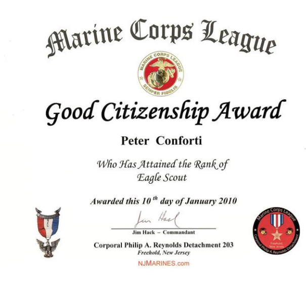
Personalized with Det name & logo