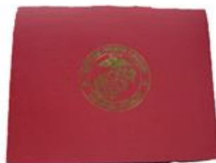
Red Presentation Folder with embossed MCL logo