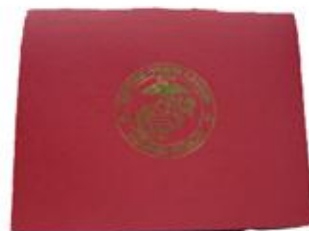
Red Presentation Folder with embossed MCL logo